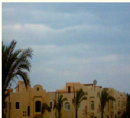
Figure 6: A complete chemtrail cloud formed over Egypt, the trails could be identified in the cloud, Egypt, July 2004.

The existence and exercise of chemtrail spraying in the USA and the whole world has become well known in the last 10 years. It's kind of hard to miss [10]. The vast expense of the project indicates that there are many different aspects to it, as well as a total disregard for human health. Environmentalists and physicians identified and recorded 9 risks on existing resources of our planet and human health as potential unintended consequences or side effects for this first geoenvironmental global project in the history of mankind.