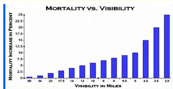
Figure 7: Mortality rates in humans increased as function of the decrease in horizontal air visibility caused by chemtrails dust in USA. (source: American Heart Association AHA, June 1, 2004 [18]).

A relationship was found by American scientists between air visibility and human mortality rates that were published by the American Heart Association (AHA) in 2004 [16,17]. Mortality increased mostly among aged persons and infants by 25% when the horizontal air visibility decreased to 2.8 miles (Figure 7).