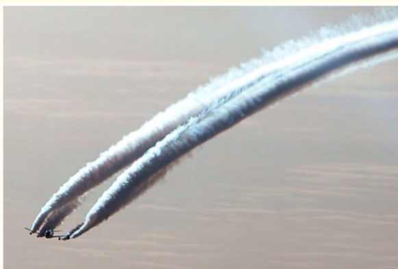
Figure 2: Jet in the stratosphere spraying chemtrails of aluminum oxide (Welsbach particles) and barium salts in the stratosphere.