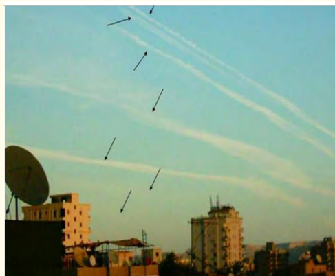
Figure 3: Sprayed chemtrails of the Shield Project seen over Cairo, Egypt, July 2004.

In 2004, El-Husseini recorded the application of chemtrails reached the Mediterranean region and North Africa. The jets were seen leaving their white chemical trails extending from one side of the horizon to the other as watched over Egypt (Figure 3,4).