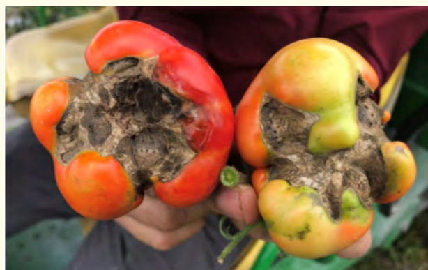
Figure 2: Tomato fruit deformation ('cat-facing') from exposure to sub-lethal doses of herbicides.

recover from spray injury metabolically depends on the intensity of exposure and stage of growth. Furthermore, depending on the duration of the metabolic stress, this could adversely affect the yield of the crops. Herbicide injury to plants will not only result in a growth setback but also yield loss and fruit deformations. For example, drift from glyphosate and 2,4-D have been found to cause distorted fruit (often termed as 'cat-facing') to develop in tomatoes at sub-lethal rates of exposure. Fruit deformation in vegetables is a result of physiological stress that encumbers normal fruit development (Figure 2). Scarce information exists on the cause of such fruit deformation, but exposure to herbicides during early growth stages has been considered one of the primary factors. Other reasons for such fruit deformations include low temperatures during fruit set period, nutrient (e.g., calcium) imbalance in the soil, etc.