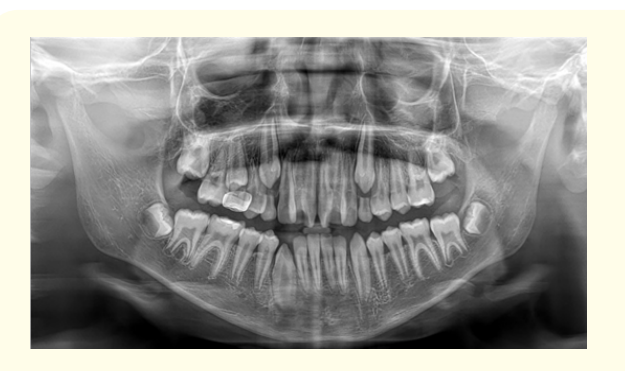
Figure 3: Pre-treatment Ortho pantomagram. Note the separate root canals of central incisors and supernumerary teeth.

Panoramic radiograph showed fusion of central incisors with supernumerary moiety at the middle of root level but both teeth had separate root canals and separate pulp chambers with the supernumerary teeth with no periapical radiolucency (Figure 3).