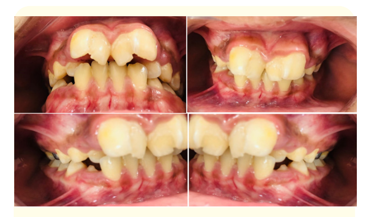
Figure 1: Pre-operative intraoral photographs. Note the fused 11 and 21.