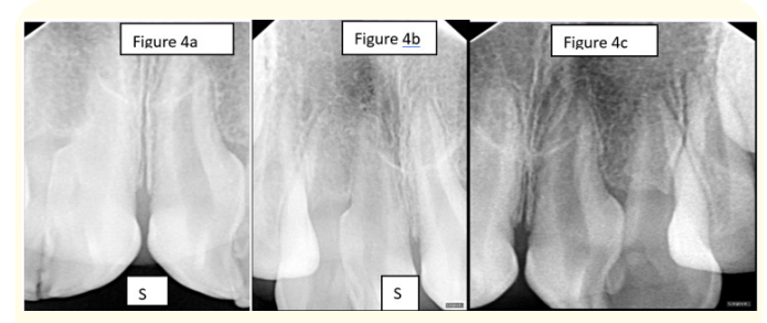
Figure 4: Pre-treatment intra oral periapical radiographs. 4a: Intra oral periapical radiograph showing supernumerary teeth(S) in the midline. Note the fusion site in the middle of the root and separate root canals and pulp chambers, 4b: Intra oral periapical radiograph showing tooth no 11 fused to supernumerary tooth, 4c: Intra oral periapical radiograph showing tooth no 21 fused to supernumerary tooth.

Periapical radiograph was taken to confirm the level of fusion and to finalize the diagnosis of the fused teeth. From the combined clinical and radiographic examinations, a diagnosis of fused teeth withnecrotic pulp, and treatment consisted of endodontic therapy and extraction of the supernumerary teeth with the reconstruction of hard dental tissues followed by orthodontic treatment (Figure 4).