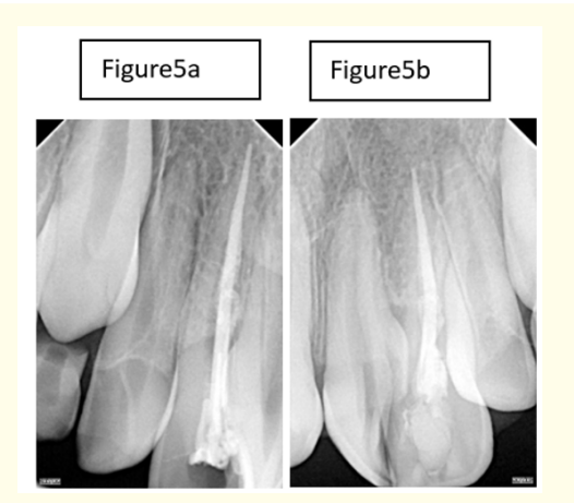
Figure 5: Post -treatment intra oral periapical radiographs. Figure 5a: Post obturation. Figure 5b: Post obturation tooth no 21.

Skeletal correction with maxillary headgear appliance was planned but after evaluation the patient compliance level, the treatment was deferred.