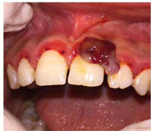
Figure 3: Immediately after Intralesional STS lesion color changed to bluish red.

No local anaesthesia was used during the procedure. The patient was completely comfortable. Lesion regressed completely after 2 sessions with no recurrences (Figure 4 and 5).