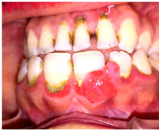
Figure 1: Clinical appearance of the PG present with respect to 21, 22.

Intraoral examination revealed a pedunculated lobulated gingival overgrowth extending on buccal surfaces of 21, 22. It was reddish pink in color and approximately 15 mm × 10 mm in size (Figure 1). The surface was smooth, no ulcerations were seen. Bleeding on touch was evident. Oral hygiene was poor and the oral cavity showed increased amounts of calculus. Teeth associated with it did not show any mobility. Radiographically, there were no visible abnormalities and the alveolar bone in the region of the growth appeared normal. Routine haemogram was found to be normal. A provisional diagnosis of pyogenic granuloma was made.