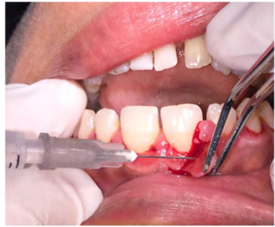
Figure 2: Intralesional STS given at the base of the pedunculated mass.

Firstly, Oral prophylaxis was completed. Later, intralesional injection of undiluted 0.2 ml of 3% sodium tetradecyl sulphate injection was given at the base of the pedunculated mass till the point of blanching. After this, the lesion was compressed with cotton gauze for 1 - 2 minutes (Figure 2 and 3). There was no bleeding during the procedure.