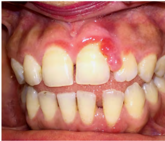
Figure 4: 80% resolution of the mass on 2 nd visit of patient.