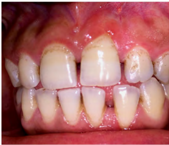
Figure 5: Complete resolution of the mass at the patient's 3 rd visit.

hemorrhage either spontaneously or upon slight trauma. It bleeds easily because of its extreme vascularity. The color varies from red to pink to purple depending on age of the lesion. It arises most frequently on the gingiva, followed by lips tongue and buccal mucosa and occasionally on other areas. It is most common in young female, due to hormonal influences on vasculature. Pyogenic granuloma when appears during pregnancy are termed as pregnancy epulis/tumor or granuloma gravidarum [1,2].